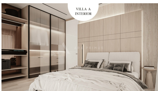
VILLA A INTERIOR