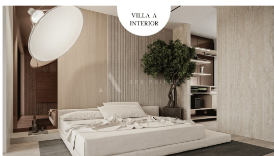
VILLA A INTERIOR